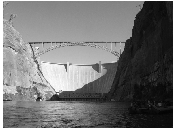
Glen Canyon Dam